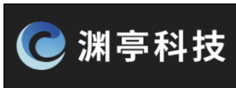
Figure 3: DataExa's logo

DataExa was founded in 2014 and claims to specialize in technologies like large models, machine learning, deep learning, and reinforcement learning. 47 National defense is among DataExa's main areas of business, and the company's clients reportedly include the Central Military Commission (CMC) Science and Technology Commission, the CMC Equipment Development Department, PLA theater commands, the former PLA Strategic Support Force, the PLA Navy, the PLA Army, China Electronics Technology Group Corporation (CETC; 中国电子科技集团公司), NORINCO Group, and national defense research institutes. 48 The company is an OSINT platform provider for the PLA; Insikt Group previously profiled DataExa in our 2023 report on the PLA's embrace of OSINT. 49